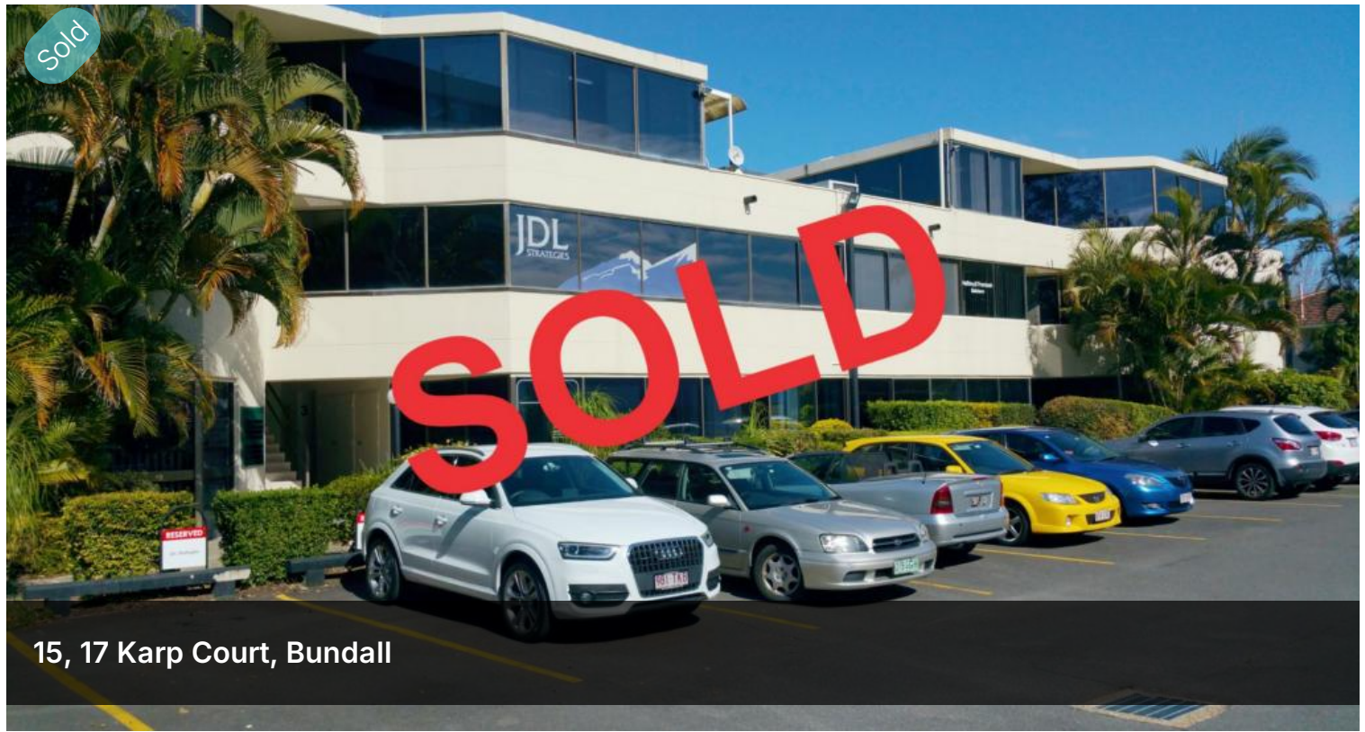
15, 17 Karp Court, Bundall